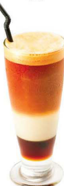
thai iced tea