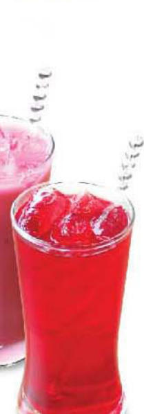
rose syrup & bandung