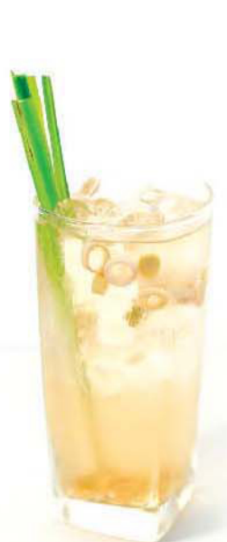
iced lemon grass juice