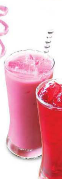
rose syrup & bandung