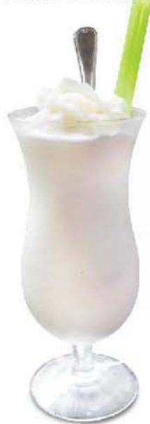
iced blended fresh coconut