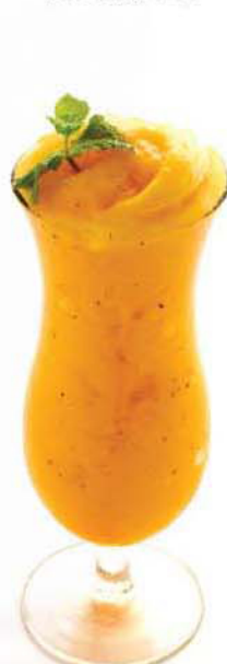
mango mama smoothies