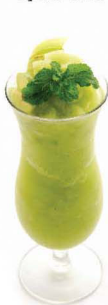
iced blended lychee mint