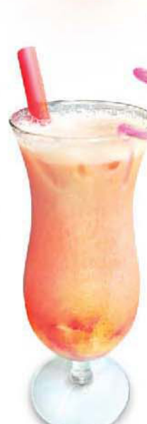
thai thai fruit punch